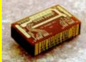
High Density Electronics