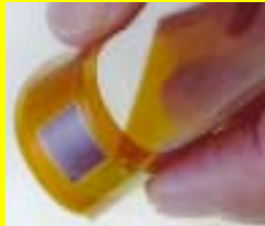
Ultra-thinning/ Flexible Circuits