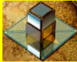
3DANN™ 1 Tera-Op Processor