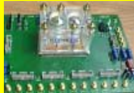
High Density Interconnects/ Photonics Communication